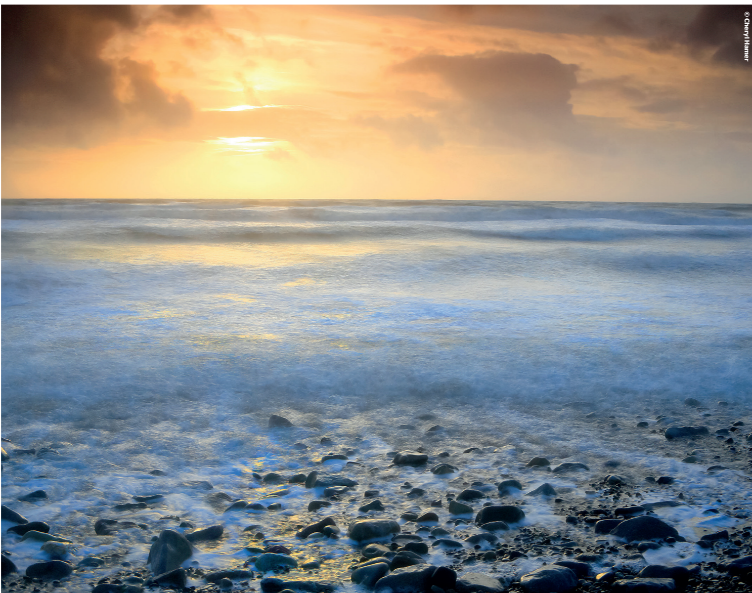
Above Pebbles and Pastels by Cheryl Hamer.

Beata: I firmly believe that all visitors will find something interesting in the exhibition. There are classic and modern images, open vistas and details, plenty of colour but also sublime monochrome. The images flow effortlessly, taking viewers on an artistic journey through landscapes and light.